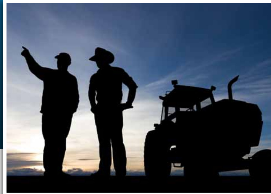
CCA Program Participants

CCAs are required to have years of experience working in specific geographical areas. This means your CCA understands why the challenges you face every day are different from the ones someone across the country encounters.